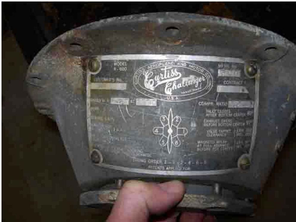
The original engine data plate.