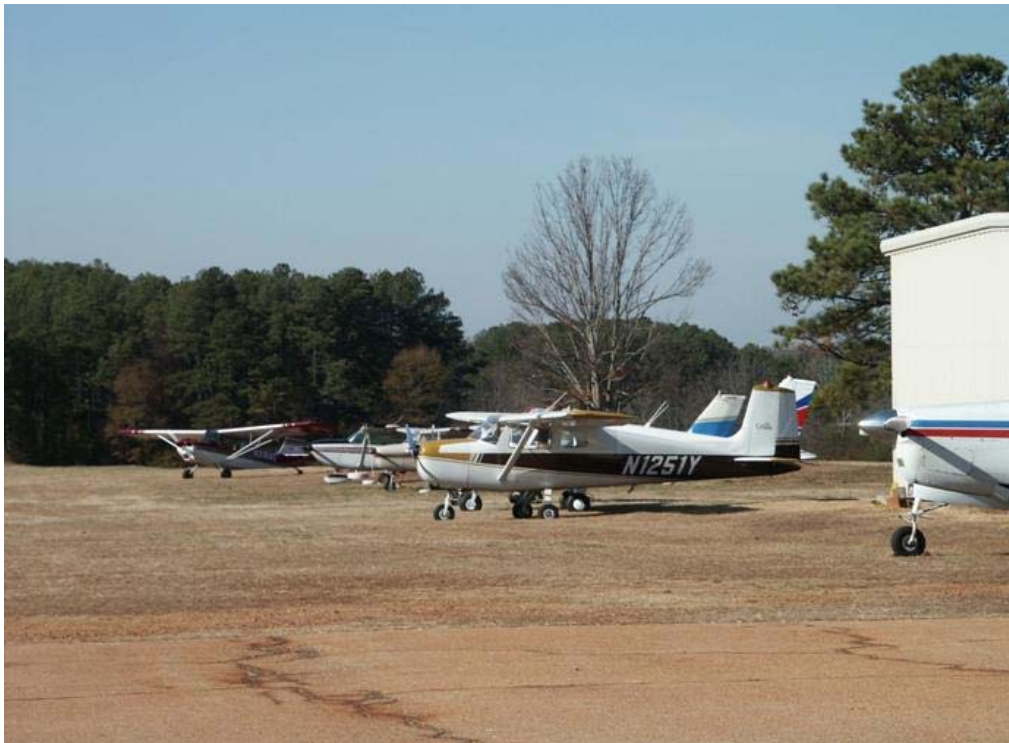
A gathering on Saturday for lunch.

Our weather conditions for the month of December have been good. We have had several warm days allowing us to fly our open cockpit airplanes. Many of us have taken full advantage of the weather as you can see from the pictures that follow. Most of these were taken in mid December.